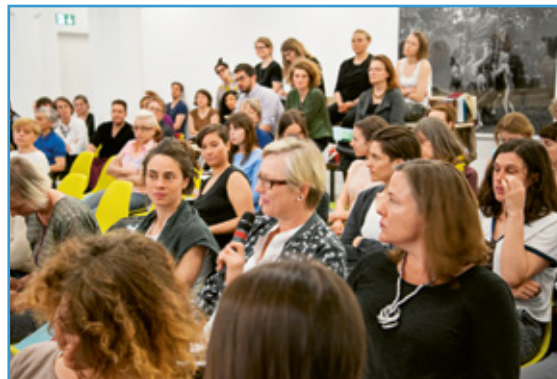
Symposium: Curating in Feminist Thought